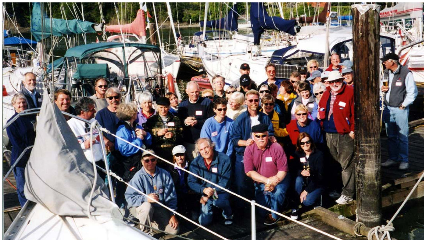
On the docks at the 2003 Port Browning Spring Rendezvous

Port Browning, the ever-popular Gulf Islands rendezvous location, will see CS West return for its eighth annual spring rendezvous on the long weekend in May. Unlike last year, the weather promises to be bright and sunny all weekend. Great sailing winds are forecast on