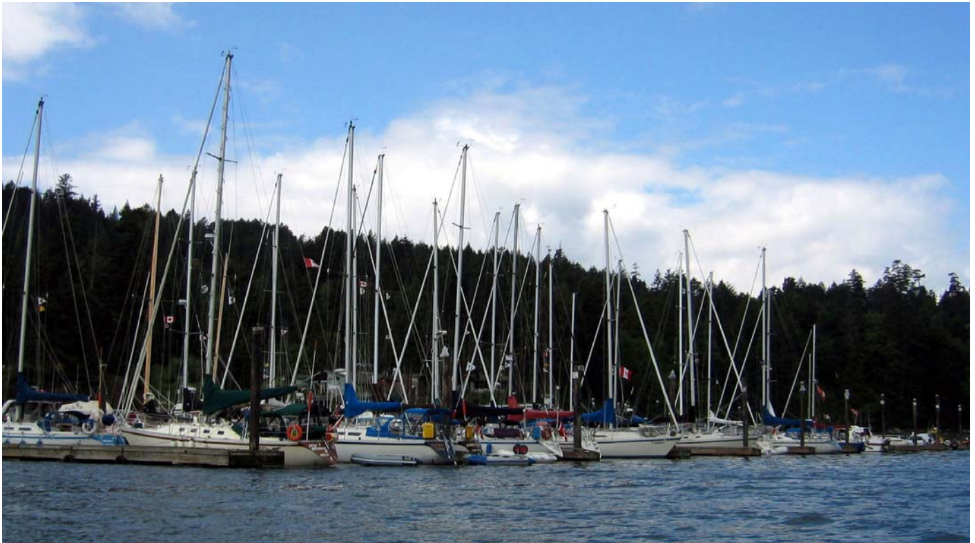
The boats at the Port Browning 2003 Spring Rendezvous

a potluck dinner. The “formal” program will commence on Saturday afternoon, allowing time for the rest of the fleet to arrive by midday.