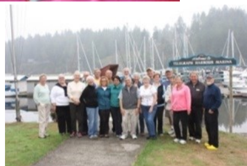
Parting Group Photo