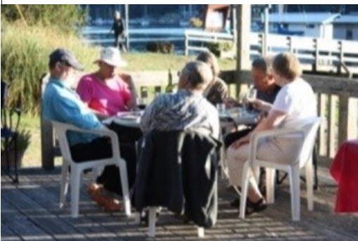
Relaxing With Friends