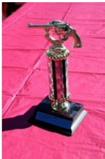
Our Trophy This Year!