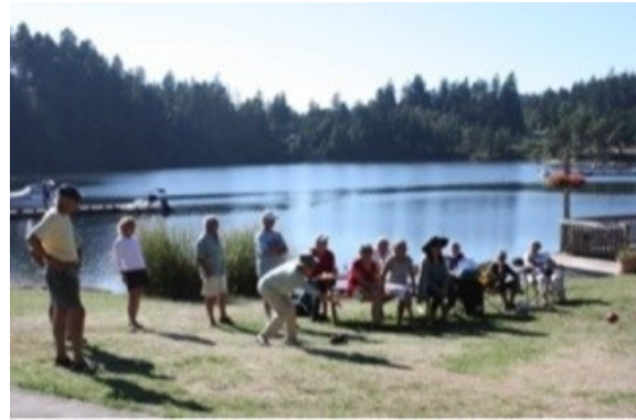
Competing against the Sceptre Club