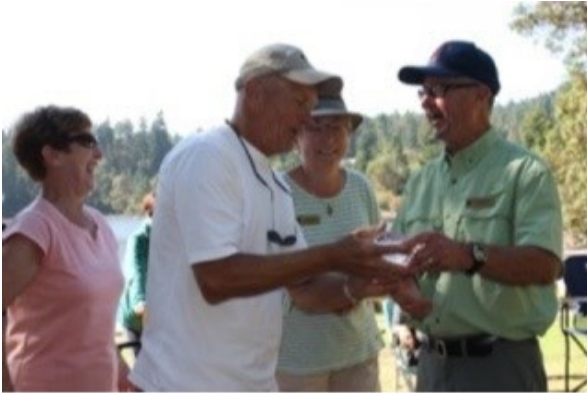
Passing on our Trophy