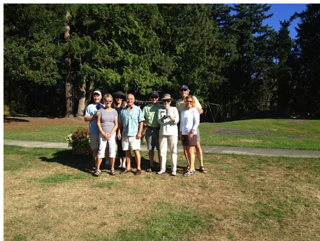
We slaughtered Sceptre!!