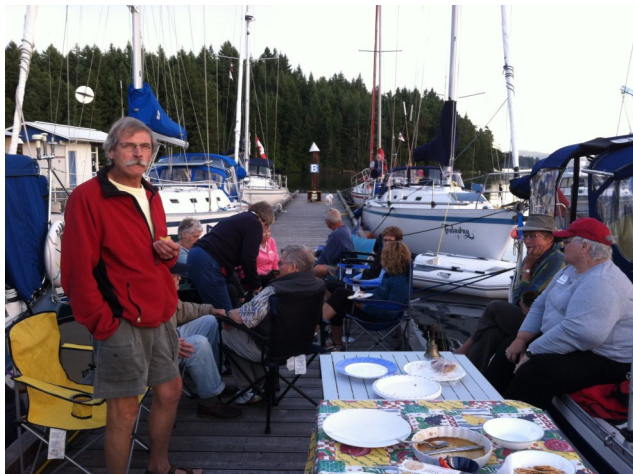
Friday Happy Hour