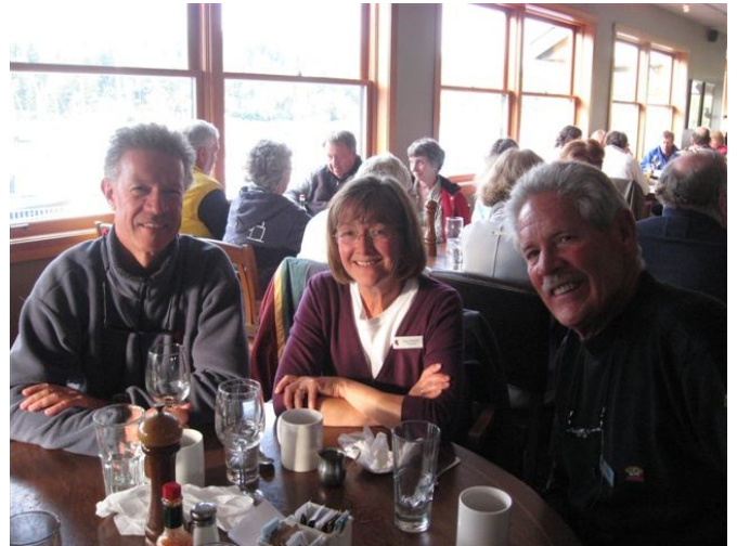
Right: Port Browning Mini Rendezvous