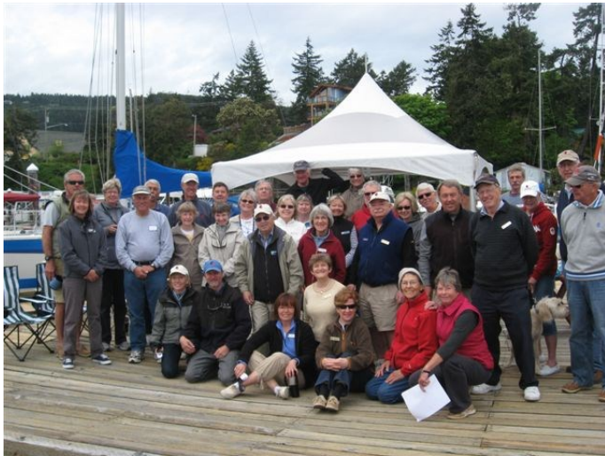
Above: Ganges May Rendezvous