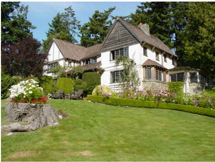
Hastings House in Ganges

Our first destination was Ganges. We set sail from Sidney under gennaker and, a few hours later, were tied up at Moby’s Marina in Ganges Harbour. Our elderly couple stayed in Hastings House - a short uphill walk