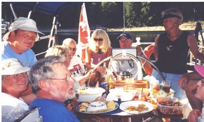
above Squirrel Cove, below Grace Harbour