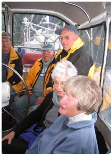
Some of the fourteen "happy-folks" in Gadgets' cockpit escaping the rain on Saturday

Port Browning Rendezvous (con't) - have two beautiful siamese cats that walked the docks on leashes along with the Duffley's white cat. Havre de Grace is destined to be renamed Feliner .